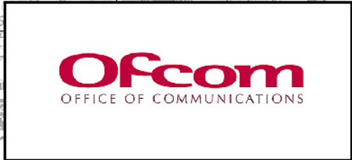
Reigate & Crawley AMCA (Classic Gold 1521) - 29th December 2003